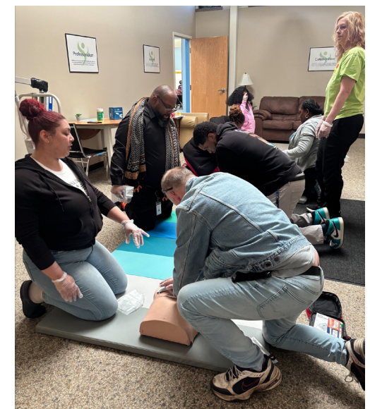
Staff participate in CPR and AED training in the academy mock apartment.