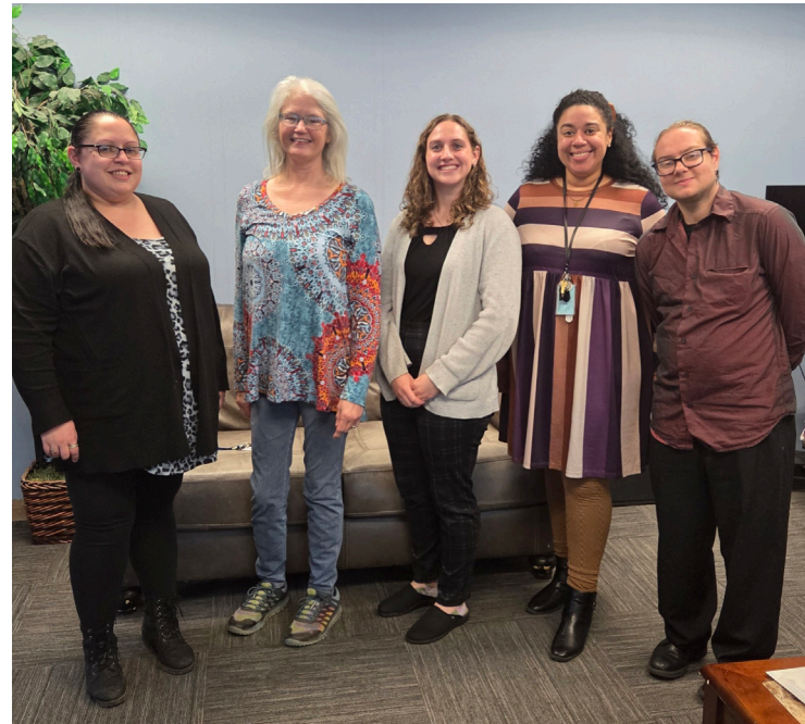
Our Unique Peerspectives team will be able to provide members better access to other community-based services.

These changes will make it easier for more people to participate in AccessCNY programs this year and in the future. All of our Mental Health teams at AccessCNY look forward to meeting new people and helping them to reach their goals! To learn more visit: www.accesscny.org