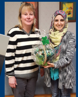
Winners of the Pot 'O Gold